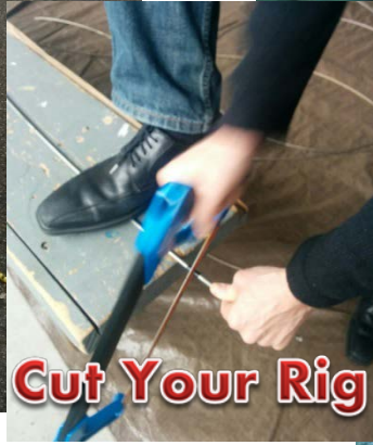
Cut Your Rig