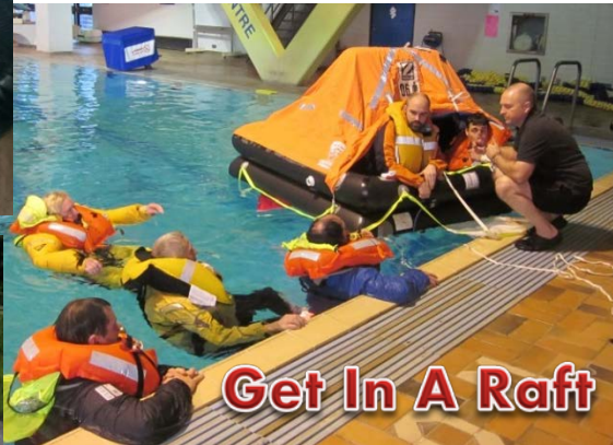
Get In A Raft